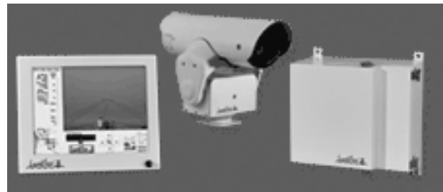
(3) basic components. Screen, Camera and Computer Server