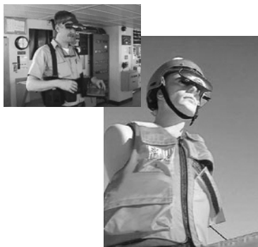
Original ‘wearable computer’ and goggles on left and redesigned unit on the right.

The filter has proven easy to operate and any of our students are now able to demonstrate the unit operations as well as explain it’s function and worth to them as an operating engineer.