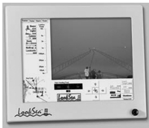
LookSea screen in reduced visibility

“LookSea™ Pro is the most advanced electronic chart system available and can also provide a focal point for your integrated bridge system. The LookSea system takes video data from an exterior camera, converts electronic